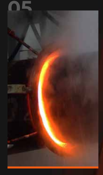
Induction Bending Machines