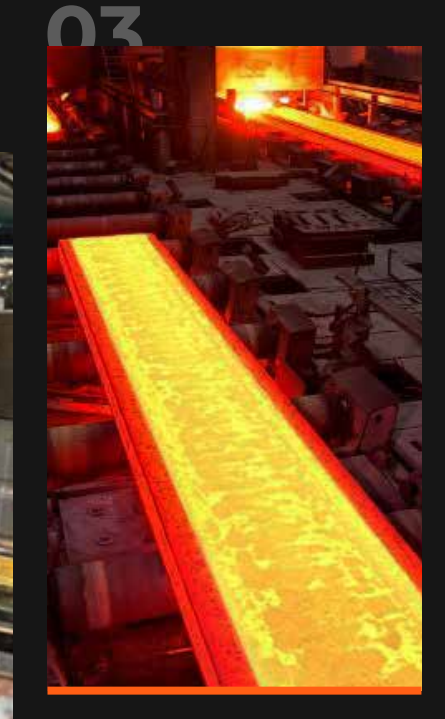
Induction Annealing Machines