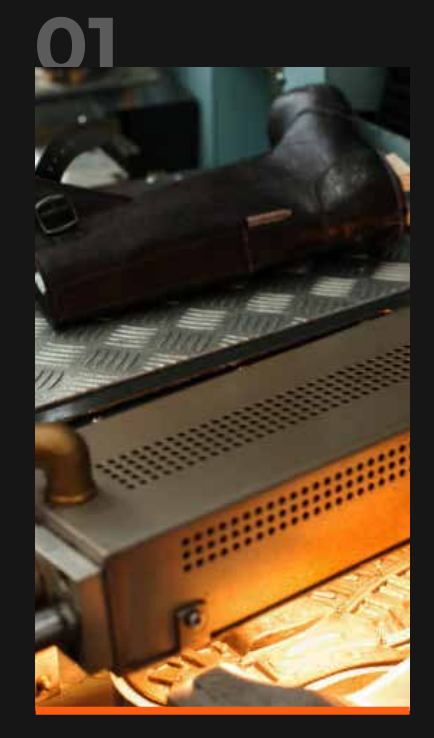
Induction Hardening Machines