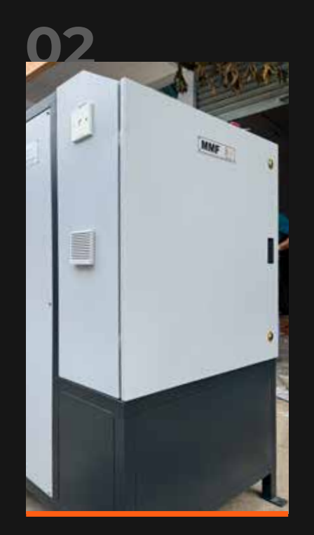
Temperature Controlled Unit